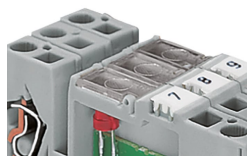
Marking via Mini-WSB Quick Marking System